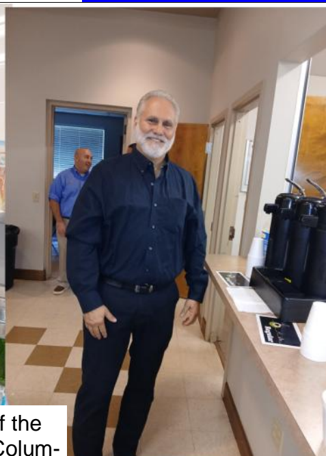
Pancake Breakfast on fifth Sunday of the Month sponsored by the Knights of Columbus Council 18557 and Supported by the Council of Catholic Women